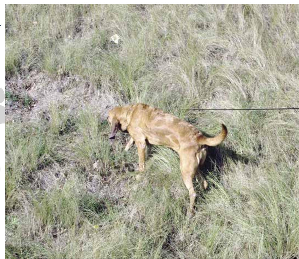
Butters on a scent.

Belgian Melinois are agile, swift, athletic dogs often described as the